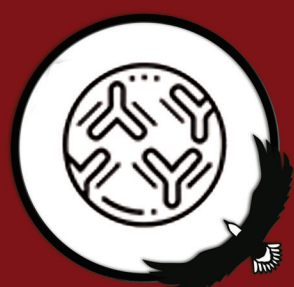
Produce antibodies to fight the virus