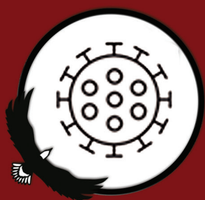
Recognize the virus