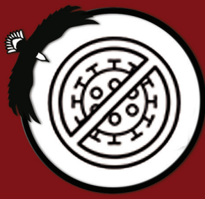
Destroy the Infected cells