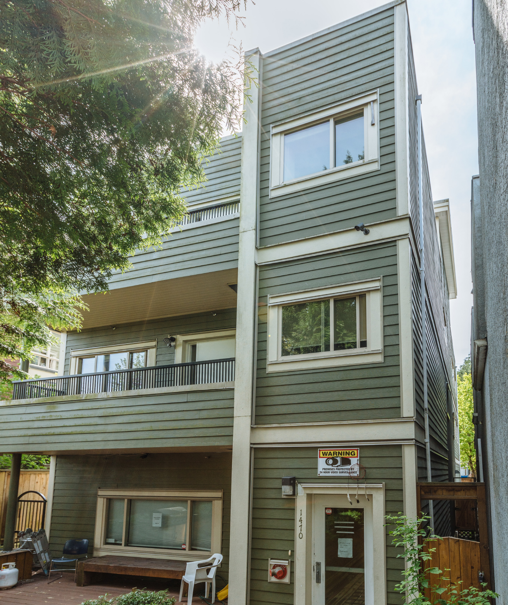
Circle of Eagles Lodge for Men