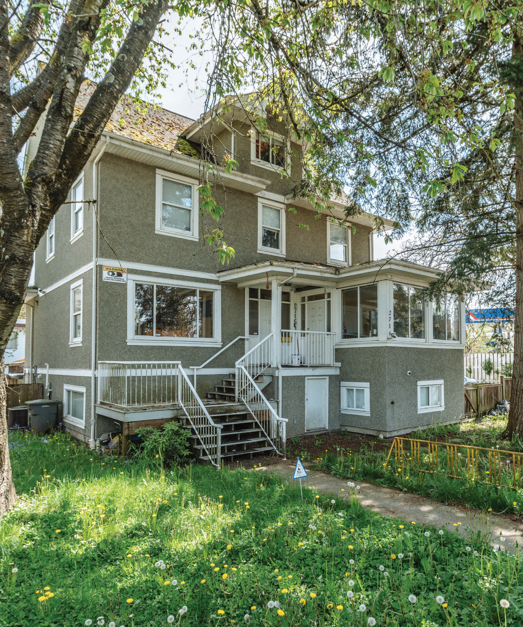
Anderson Lodge Healing Center for Women